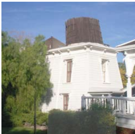
The Tank House

Friends of Ravenswood can join the Ravenswood Progress League (RPL), a nonprofit organization supporting restoration and volunteer programs at the Historic Site. For information on the RPL or the volunteer Docent Program, please call the Docent Coordinator at (925) 443-0238.