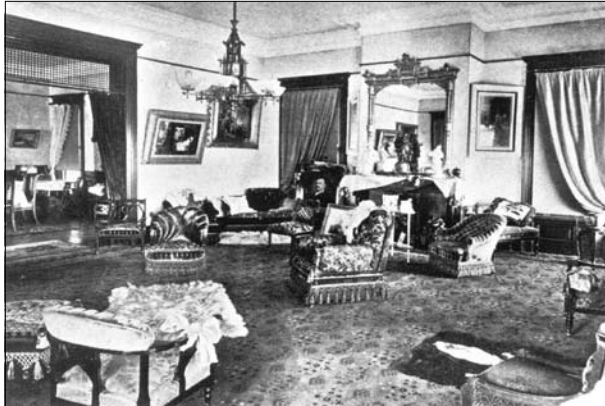
Main House drawing room, 1896.