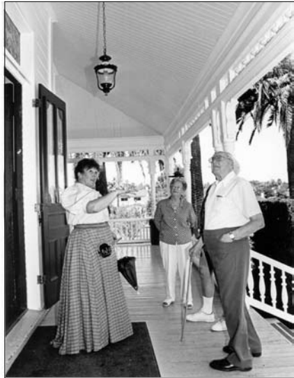
Costumed docents give free, monthly tours.

Opportunity awaits... Be a volunteer docent!